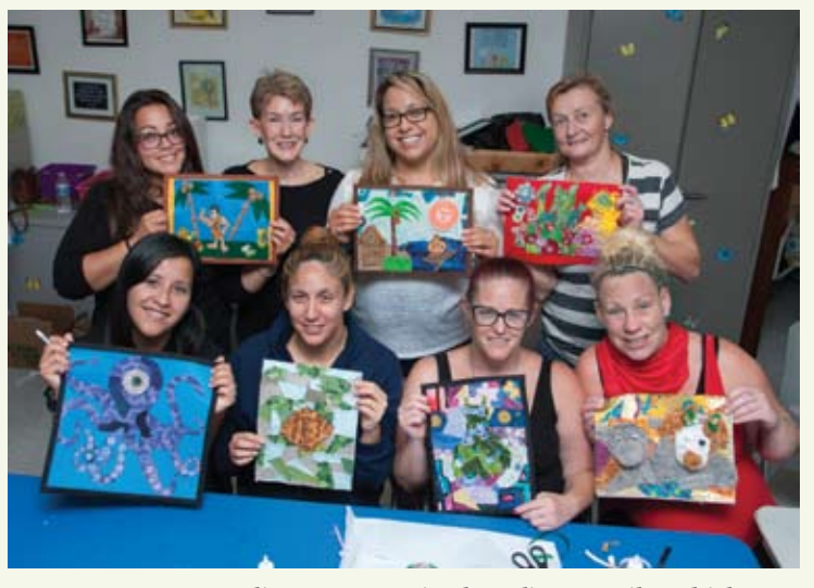
ParentCare clients create mixed-media art quilts which were shown at the Visions Art Museum December 5-17.

thing that gives them a sense of pride and accomplishment."