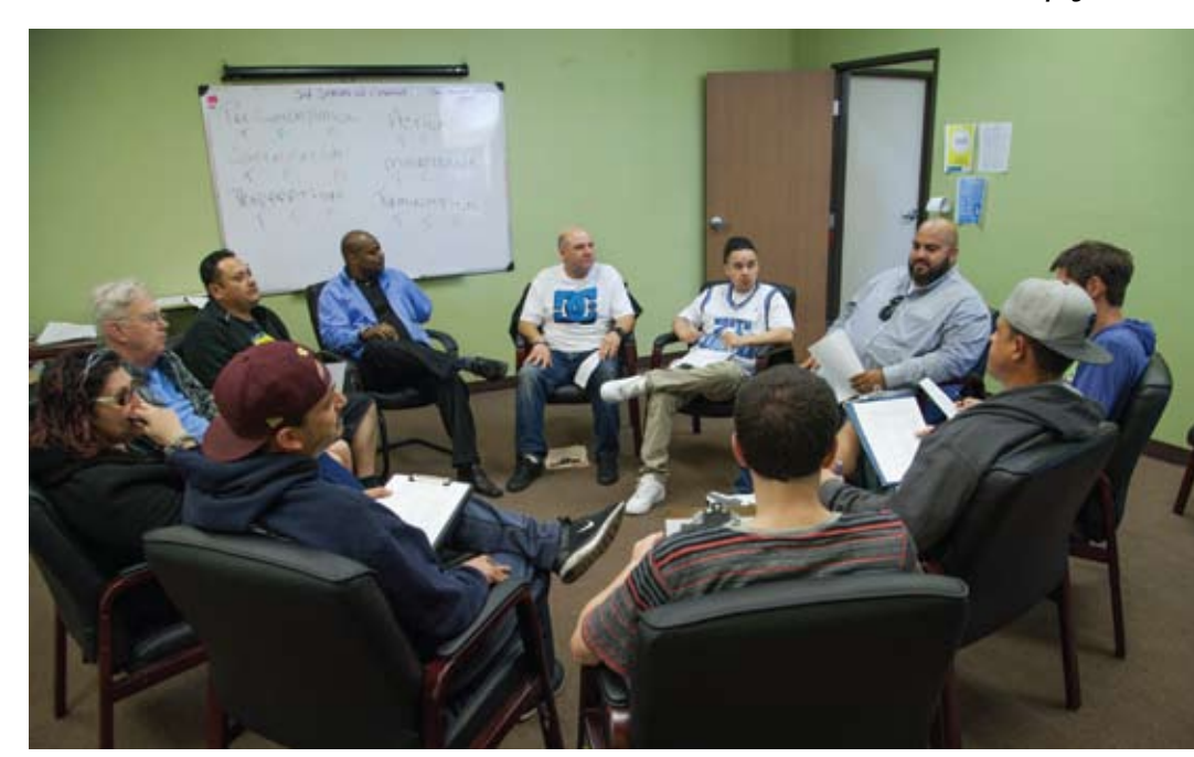
Clients participate in a treatment group to develop coping skills to remain substance free.