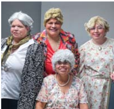
Vista Hill's very own Golden Girls from the Stein Education Center Adult Services.