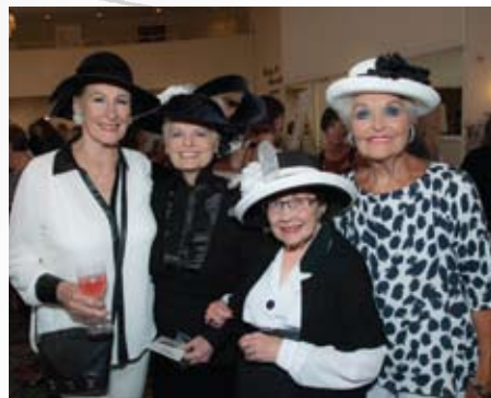
Hats off to these lovely ladies for never missing a Vista Hill Fashion Show!