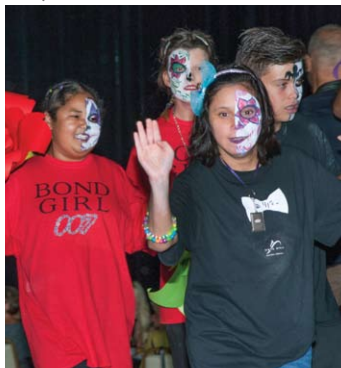
Stein Education Center "Bond Girls" and "Secret Agents" paraded on the runway