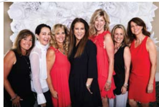
The hardworking and fun loving Fashion Show Committee members with Rita Coolidge (center)

Vista Hill's 26th Annual Fashion Show Luncheon was a great way to celebrate our 60th "Diamonds are Forever" Anniversary. The theme was a fusion of James Bond and Cinco de Mayo, hence the title "Double Oh Siete" and date, which was on Friday, May 5th.